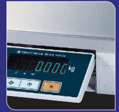
Tiltable VFD Display