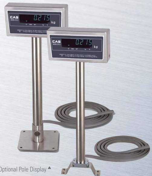
Optional Pole Display ▲