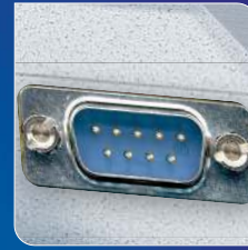
RS-232C Serial Port